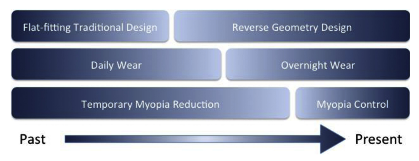
Fig. 2. The evolution of orthokeratology.

keratitis by the panel. Neither resulted in any documented long-term loss of best-corrected visual acuity, and both occurred in children. The overall estimated incidence of microbial keratitis is 7.7 per 10,000 patient-years (95 % CI: 0.9–27.8). For children, the estimated incidence of microbial keratitis is 13.9 per 10,000 patient-years (95 % CI: 1.7–50.4). For adults, the estimated incidence of microbial keratitis is 0 per 10,000 patient-years (95 % CI: 0–31.7).